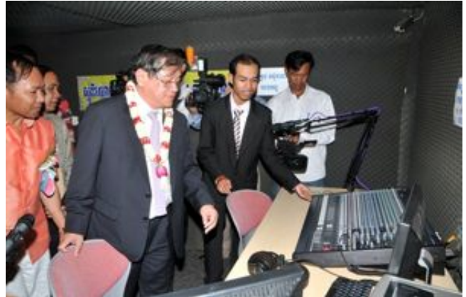
H.E. Khieu Kanharith, Minister of Information on Thursday cuts red ribbon to inaugurate the DP-Sweet Radio FM 99.75MHz in Phnom Penh.