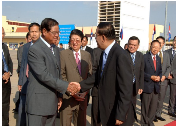
Samdech Akka Moha Sena Padei Techo Hun Sen shakes hands with Deputy Prime Minister and Minister of Interior H.E. Sar Kheng and other senior government officials at Phnom Penh International Airport

Hun Sen will meet with President of JICA, President & CEO of Nittetsu Mining Co., Ltd., President of Keidanren, President & CEO of Mitsui Oil Exploration Co., Ltd. (MOECO), and CEO of Minebea Co., Ltd., it said.