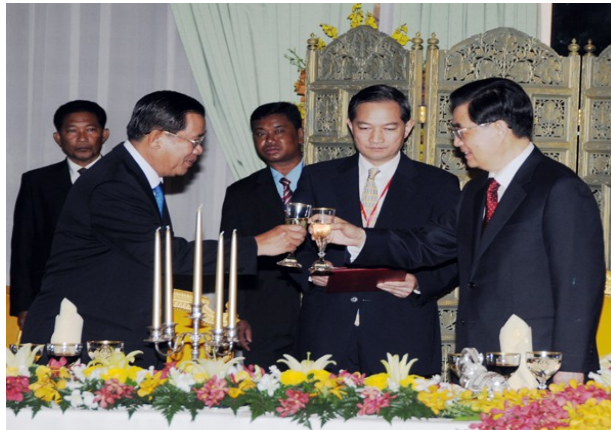
His Majesty Norodom Sihamoni, at the Royal Palace in Phnom Penh on Mar. 31 with visiting H.E. Mr. Hu Jintao. The dinner reception was also attended by Samdech Akka Moha Ponhea Chakrei Heng Samrin and Prime Minister Samdech Akka Moha Sena Padei Techo Hun Sen.