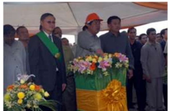
Prime Minister Samdech Akka Moha Sena Padei Techo Hun Sen cuts red ribbon and presses button to operate the machine while presiding over the inauguration ceremony of sugar cane processing refinery run by a joint-venture companies of Cambodia, Taiwan and Thailand in Cambodia's Koh Kong province on Jan. 25.