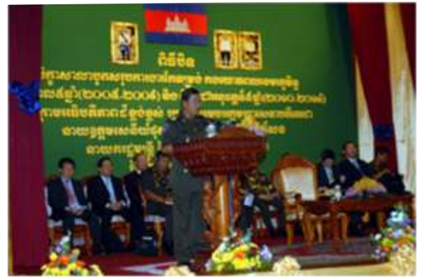
Prime Minister Samdech Akka Moha Sena Padei Techo Hun Sen presides over the closing ceremony of the stocktaking workshop on the Five-Year RCAF Reform (2005-2009) and Five-Year Direction Setting (2010-2014).