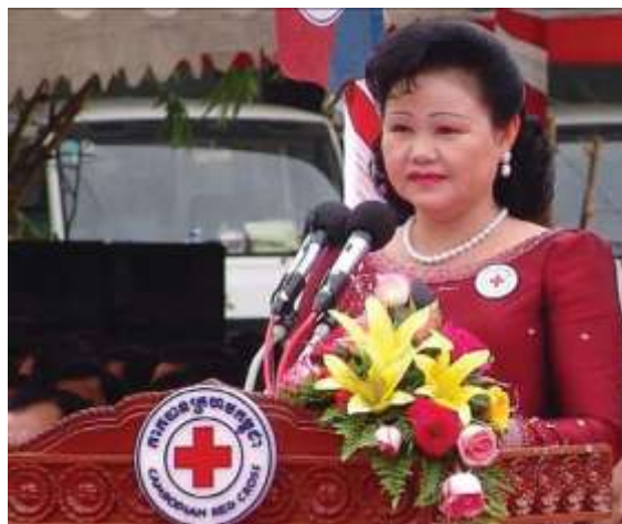
Cambodia’s first lady, Cambodian Red Cross President Lok Chumteav Bun Rany Hun Sen.

Based on the dialectics, humanity is the spirit of Cambodian ancestors prescribed in our history centuries ago, said Samdech Techo Prime Minister, this spirit is blossoming in today’s Cambodians and has transformed into what we call “the culture of sharing”.