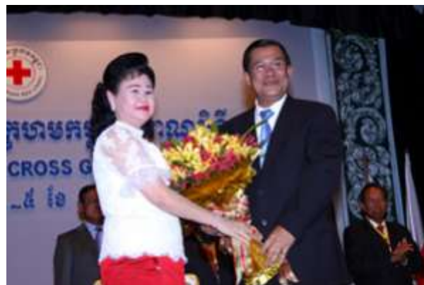
Samdech Techo Hun Sen presents a bunch of flowers to Madame Bun Rany Hun Sen while she is being re-elected President for the fifth term of the Cambodian Red Cross