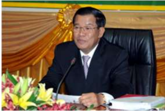
lo- Cambodian Prime Minister Samdech Akka Moha Sena Padei Techo Hun Sen.

“We have opened our economy for foreign direct investments in all sectors including banking, insurance, and telecommunications when in many countries, in such sectors, foreign investors are not allowed to control 100% of the shareholding, without