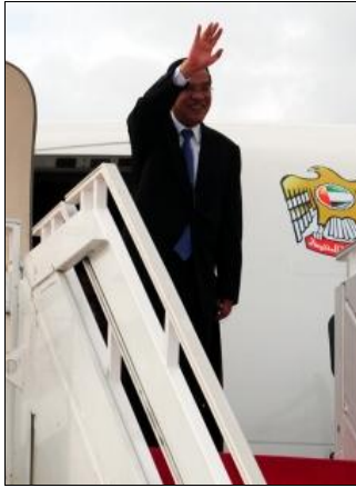
Samdech Akka Moha Sena Padei Techo Hun Sen, Prime Minister of the Kingdom of Cam-

bodia, attended on June 18th, 2012 the 7 th G20 Summit opening session in Los Cabos, Mexico with other leaders from 24 countries, as well as other partners, the National Television of Cambodia (TVK) reported.