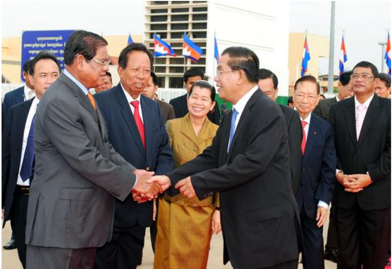
Cambodia's Prime Minister Samdech Akka Moha Sena Padei Techo Hun Sen, Chair of ASEAN, shakes hands with Deputy Prime Minister H.E. Sar Kheng, Minister of Interior and other senior government officials at Phnom Penh International Airport on June 16, prior to his departure to Los Cabos, Mexico to attend the G20 Summit to be held on June 18-19.