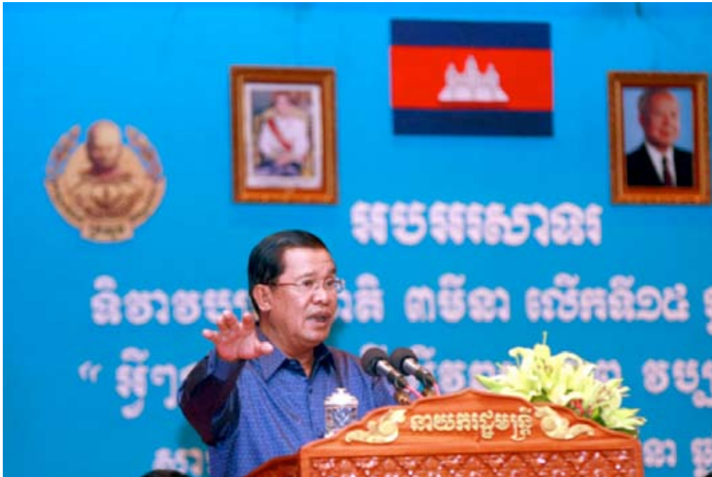
Cambodia's Prime Minister Samdech Akka Moha Sena Padei Techo Hun Sen addresses the participants while he was presiding over here on Mar 3 the celebration of the 15th National Cultural Day (Mar. 3).