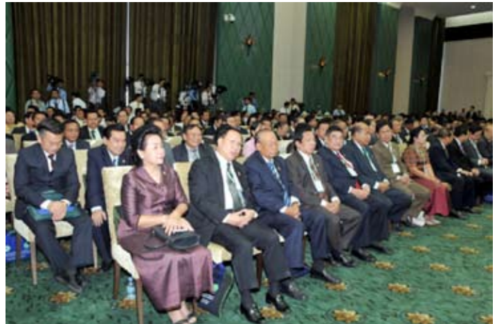
Cambodia's Prime Minister Samdech Akka Moha Sena Padei Techo Hun Sen presides over at the Peace Palace in Phnom Penh this morning the inauguration ceremony of the National Council on Green Growth (NCGG) and the Dissemination Ceremony of the National Policy on Green Growth and the National Strategic Plan on Green Growth (2013-2030).